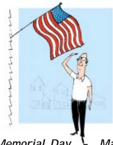
Memorial Day - May 26