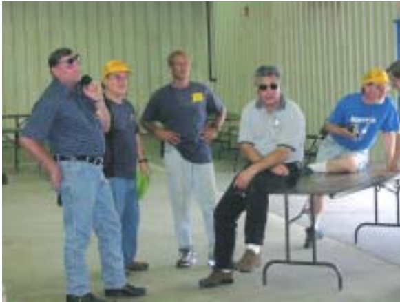
TAKING A BREAK WD9DZV WA9FTS N9LXF N9PA N9KTW