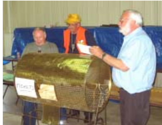
ANNOUNCING THE WINNERS WA9EMY WA9AYQ K9FFY