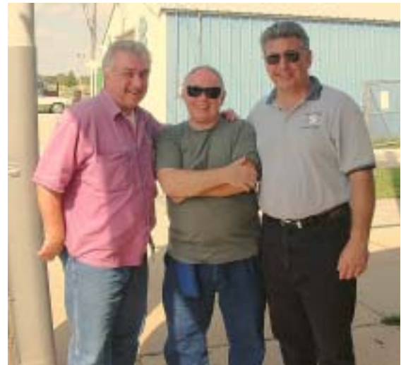
THE "BOSSSES" K9VO WA9EMY N9PA