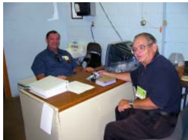
THE OFFICE WD9DZV WB9PTA