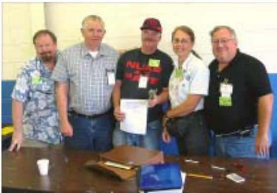
VE TESTING TEAM KC9ENZ KD9EW NK9A N1LA KG9C